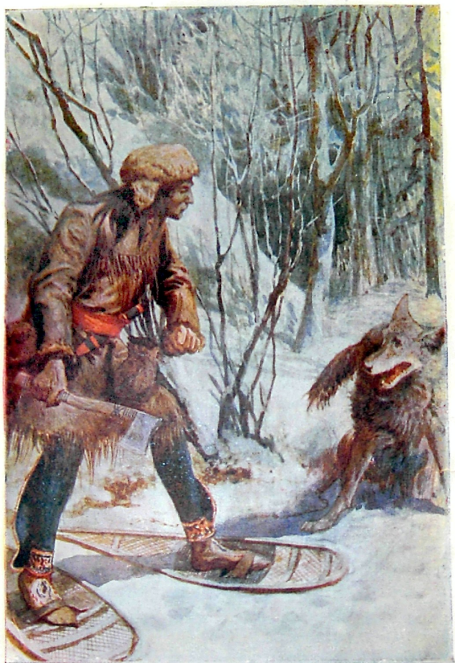
"A large wolf bounds towards him, landing almost at his feet."